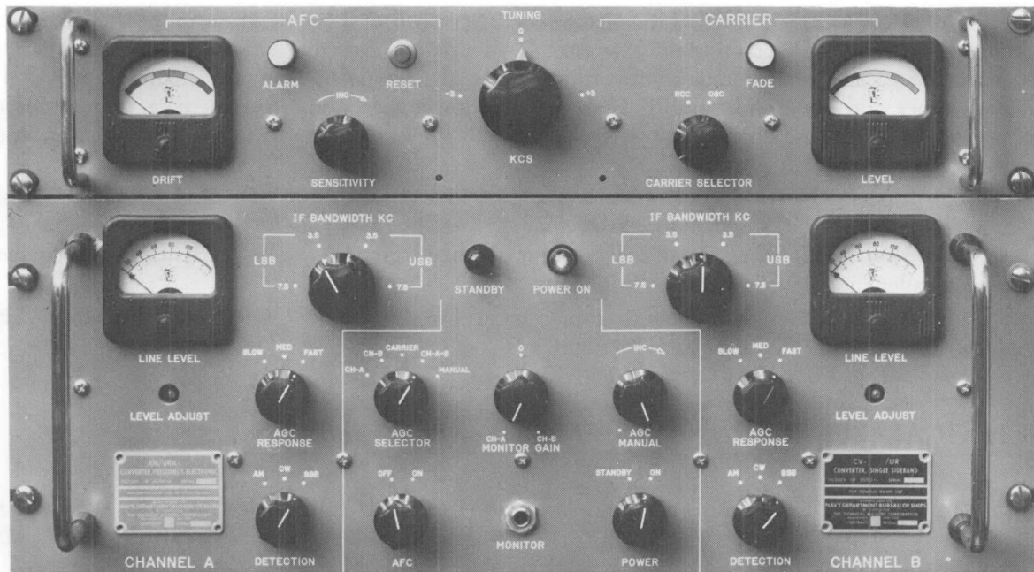
TMC MODEL SBC-1

TMC Models SBC sideband converters are IF type receiving adapters which provide optimum reception of SSB or ISB signals, with or without Automatic Frequency Control. The AFC will function with up to 30 db carrier suppression and may be disabled for the reception of fully suppressed carrier signals.