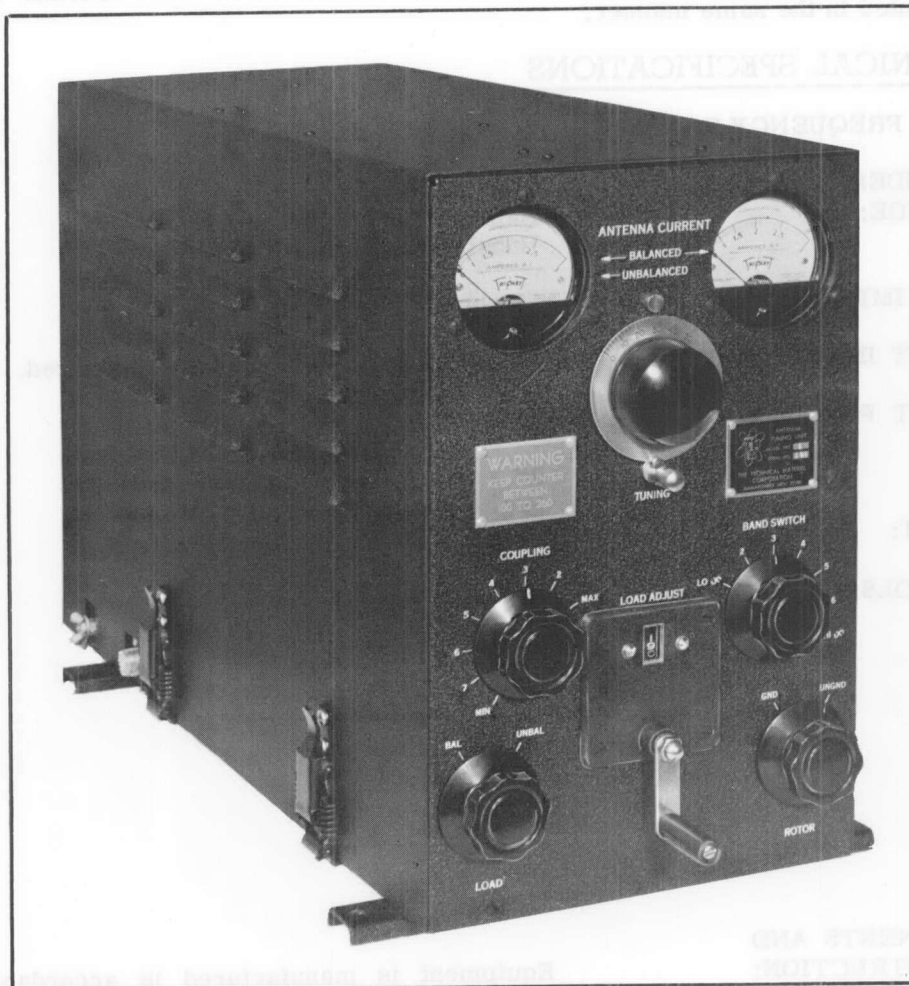
The TMC Antenna Tuning Unit, Model TAC

The TMC Antenna Tuning Unit, Model TAC, was specially designed for operation with the BC-610 or T-368 ( )/URT Transmitter, but may also be used to match any transmitter with a nominal output impedance of 70 ohms to balanced or unbalanced loads ranging from 50 to 1200 ohms. The unit covers the basic frequency range of 2 to 18 Mcs. with very little insertion loss, but provisions have been made to cover an extended range of 1.5 to 30 Mcs. unbalanced and 1.7 to 30 Mcs. balanced loads at slightly lower efficiencies.