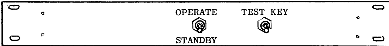
Figure 1. Control Panel, AX560A, Front Panel View

Control Panel, AX560 A (figure 1) provides standby/operate power control and a test key function for an associated transmitter system.